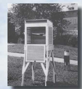
An early weather station with rain gauge and thermometers.

Entries made daily by the observers included maximum and minimum temperatures, winds, clouds, precipitation and personal or reliable witnessed accounts of atmospheric phenomena. The primary purpose was to define and determine the best use of climate data. Well ahead of the industrial revolution in America, agriculture was the focus of most of the nation's commerce and greatly depended on climate education. The Smithsonian supplied reporting forms and instrumentation necessary for the